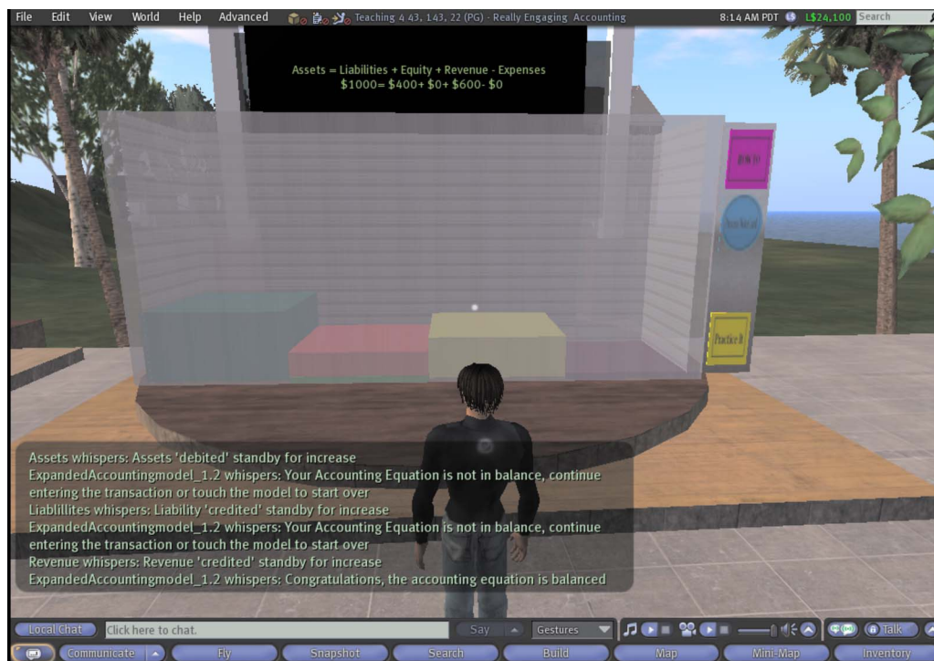
FIGURE 3 Accounting Equation Feedback

The model allowed students to visualize how a debit or credit would increase or decrease one of the account types and the impact on the accounting equation. As students interacted with the model they would continuously receive feedback from the model (in the form of text chat) indicating what a particular debit or credit transaction was doing and whether a particular transaction was balanced. See Figure 5 for an example of students using the interactive accounting equation.